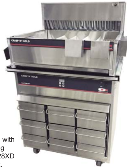
VCNH3W3S shown with optional stacking package with CNH28XD counter-top unit.