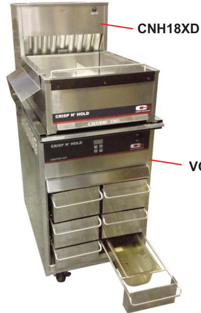
VCNH2W3S shown with optional stacking package with CNH18XD counter-top unit.

VERTICAL CRISP 'N HOLD BENEFITS... -Extend holding time while maintaining quality, consistency and freshness of food -Increase efficiency and improve speed and quality of service -Reduce food waste and ensure constant availability of product -Lower training costs, simplify staff training and supervision