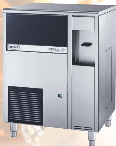
ICE WATER 45