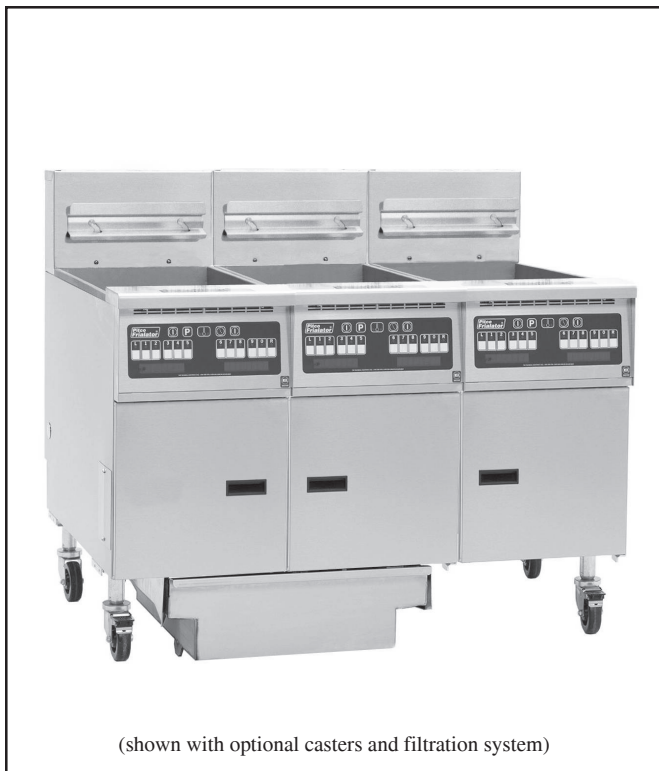
(shown with optional casters and filtration system)